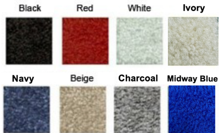
Table Skirt Colors